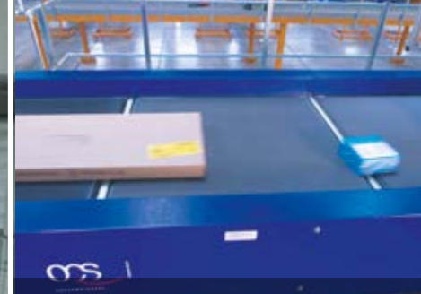
Highly precise weighing of chaotic product sequences