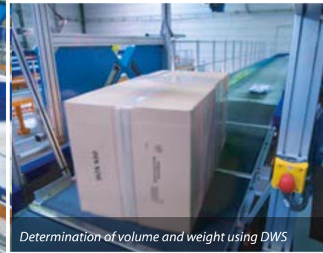
Determination of volume and weight using DWS